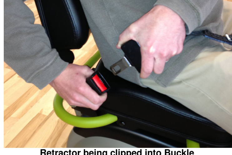
Retractor being clipped into Buckle