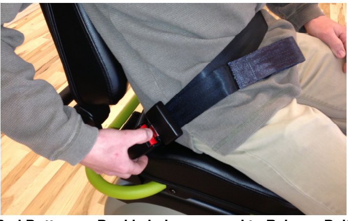
Red Button on Buckle being pressed to Release Belt

Clean Belts With Soap & Water Do Not Immerse Do Not Use Bleach.